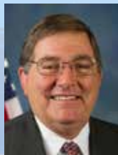
U.S. Congressman Michael C. Burgess, MD