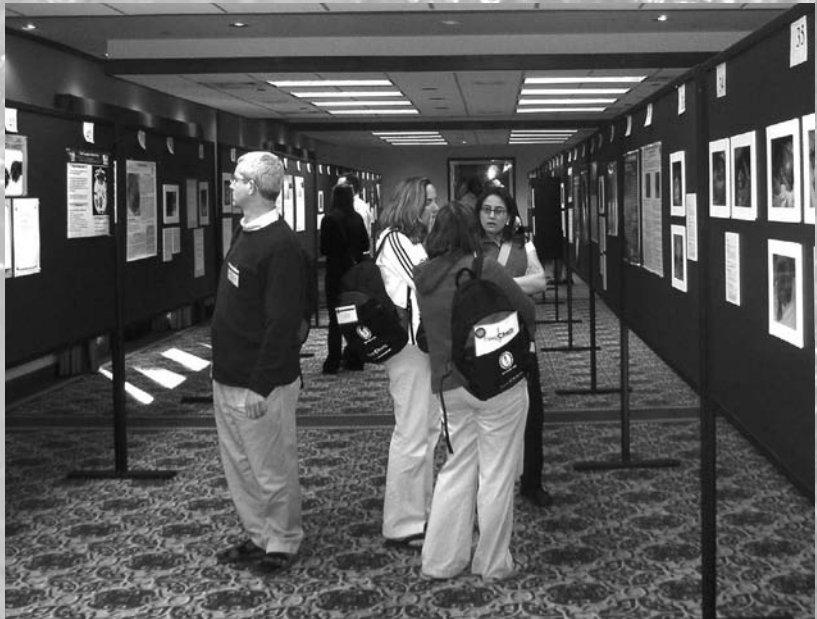
Attendees walking through the Photo Competition room. Seventy-four photos were on display at the Scientific Assembly.