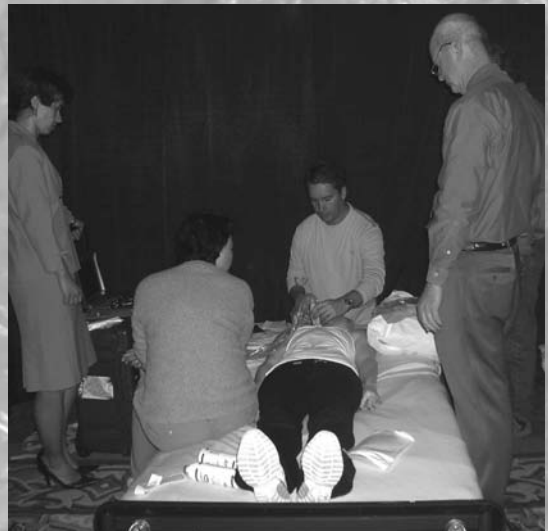
Pre-Conference courses were held February 5 and 6. The Advanced Ultrasound Course featured both didactic and interactive hands-on sessions with faculty.