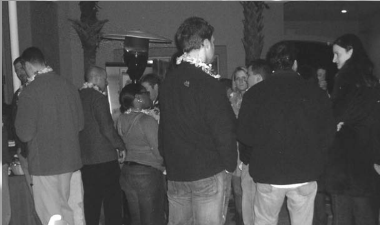
Attendees enjoying an evening by the pool at the RSA & YPS Social.